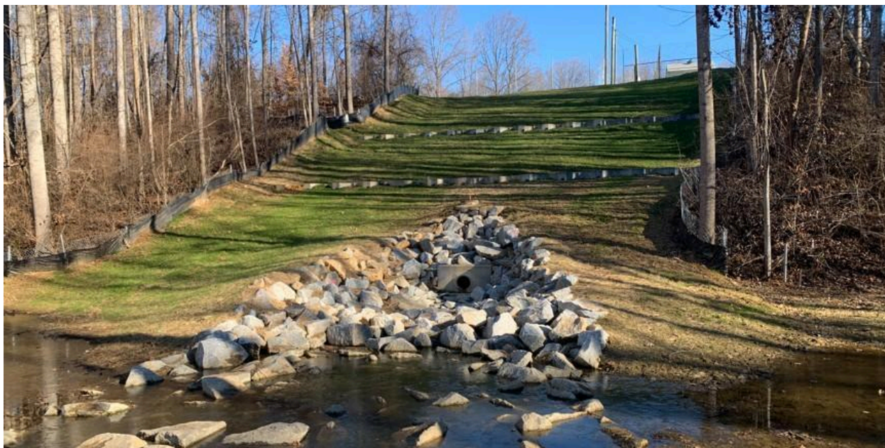
Progress at last! Slope stabilized and pond cleaned out!

• Nature Forward Stream Stories: Avril said a representative of Nature Forward was at her IMA site on March 6 th , conducting interviews with volunteers and trail users. These will be incorporated into a StoryMap that we hope to see later this spring.